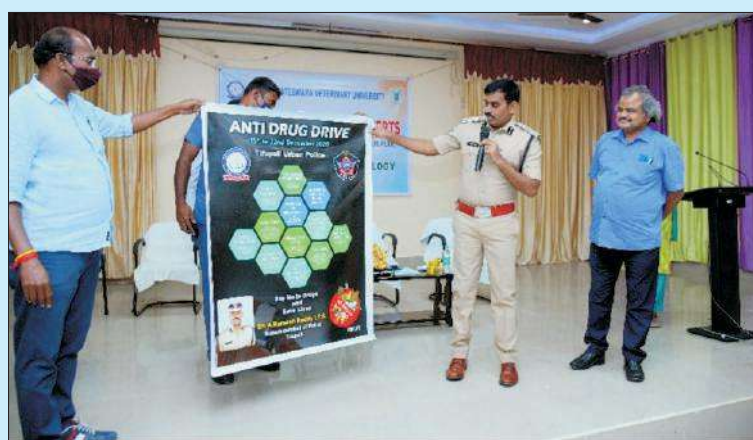
Awareness programme on the issues of ragging, cybercrime and usage of drugs organized at College of Dairy Technology, Tirupati