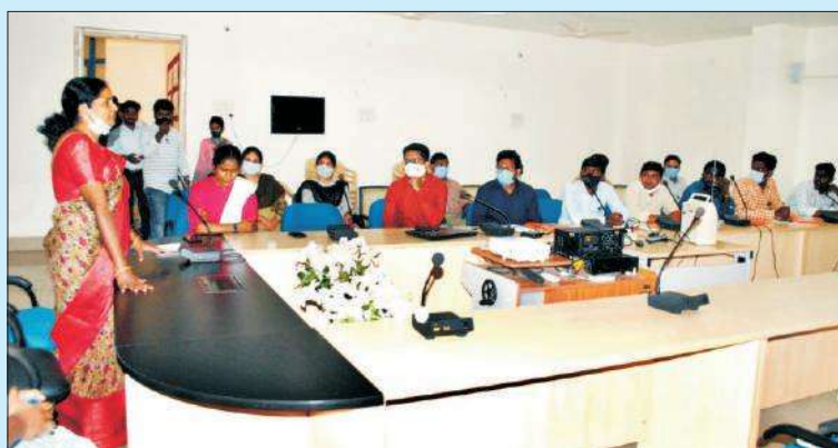
Refresher Training programme to Veterinary Assistant Surgeons at CVSc, Proddatur