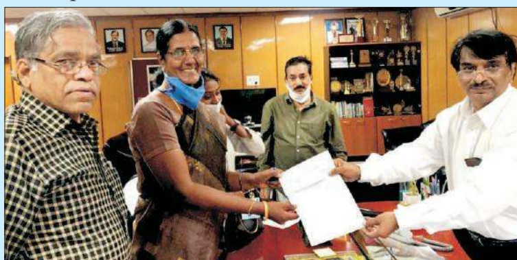
Appreciation by a pet owner to the teaching staff