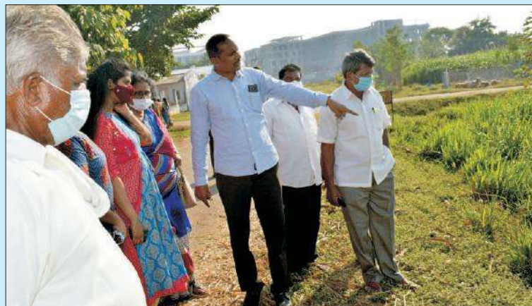
Training Programme on Importance of Fodder in Dairy Management