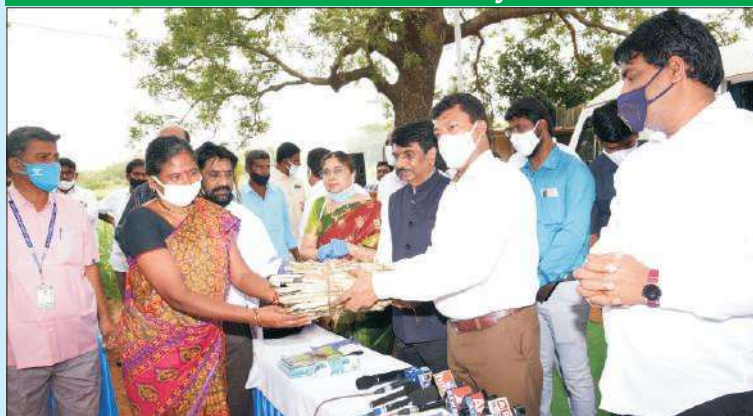
Hon'ble Minister of Animal Husbandry, AP and Hon'ble Vice Chancellor of SVVU in fodder slips distribution