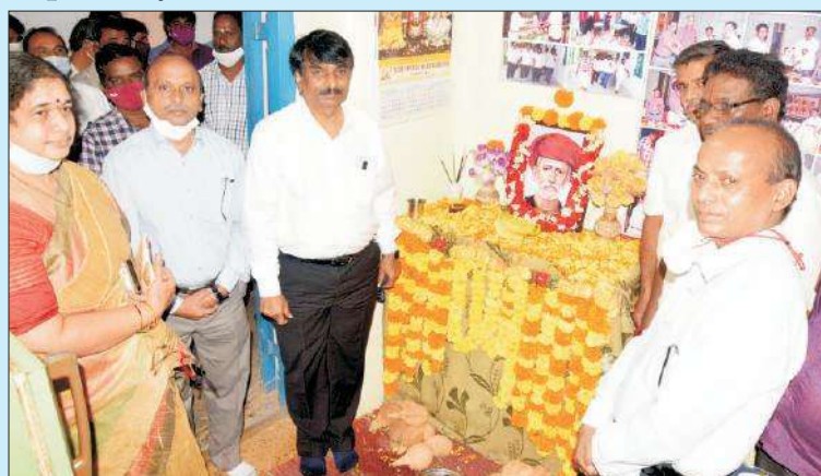
Death anniversary of Mahatma Jyothi Rao Phule observed at SVVU

Mahatma Jyothi Rao Phule's 130 th death anniversary was commemorated on 28.11.2020 at College of Dairy Technology, Tirupati. The Associate Dean, teaching and non-teaching staff and students of the college wreathed the photograph of Phule and paid rich floral tributes to him. The speakers on this occasion remembered the contributions made by him for the upliftment of the downtrodden sections of the society and emancipation of the women. An essay writing competition was held to the students on the topic "Mahatma Jyothi Rao Phule- Honorable Mahatma" and cash prizes worth Rs. 6000/- were given away to the first, second and third winners of the essay writing competition at the rate of Rs. 3000/-, 2000/- and 1000/- respectively.