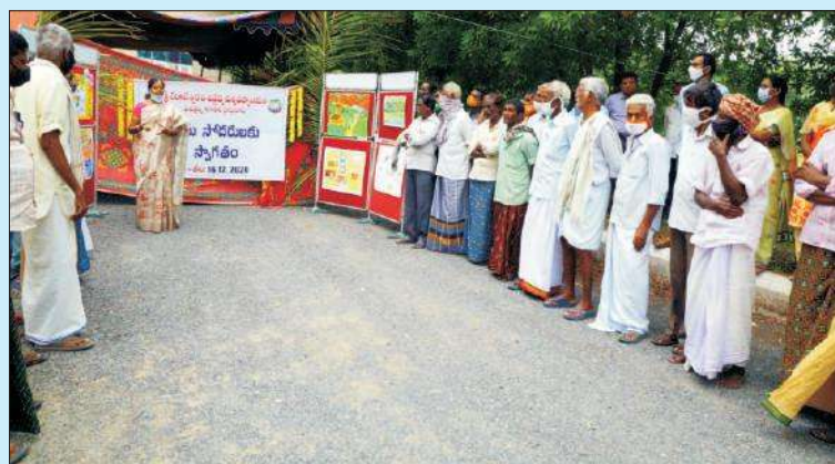
Kisan Mela organized at CVSc, Proddatur

Package of practices in AH and fodder production through fodder plot and Farm visit. Awareness about parasitic diseases, their prevention and control in Livestock was attempted. Local progressive farmers successful in Apiculture were invited to interact and spread awareness among budding entrepreneurs.