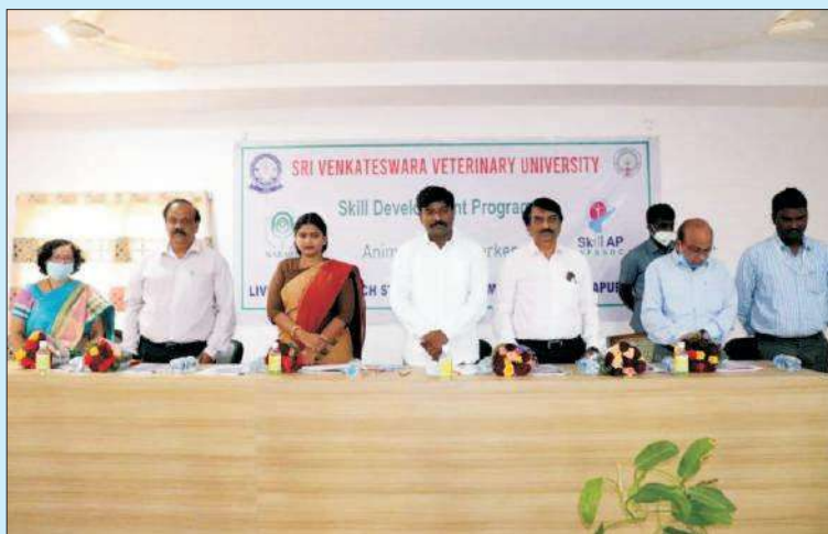
Training Programme to rural unemployed youth at LRS, Siddarampuram