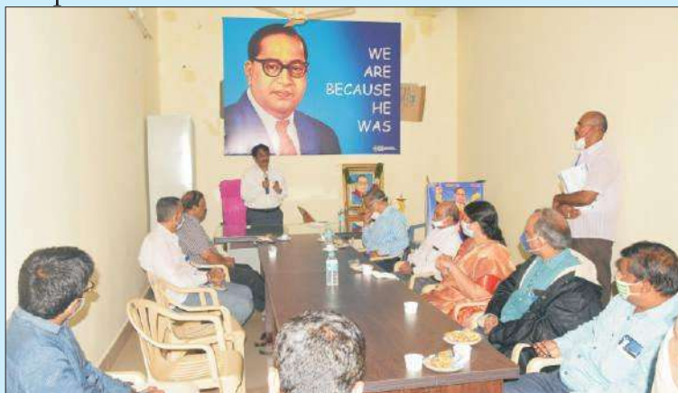
Constitution day celebrated at CVSc, Tirupati, SVVU