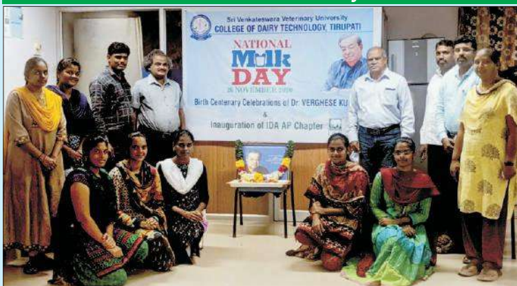
National Milk Day celebrations at CDT, Tirupati

At College of Dairy Technology, Tirupati, the National Milk Day was celebrated on 26.11.2020 to commemorate Dr. Varghese Kurien and his contributions to the development of Indian dairy industry on his birthday.