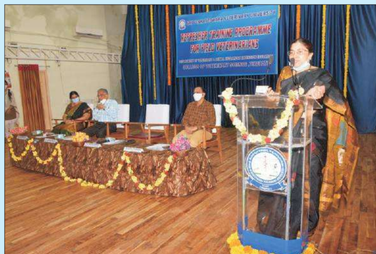
Refresher Training programme to Veterinary Assistant Surgeons at CVSc, Tirupati