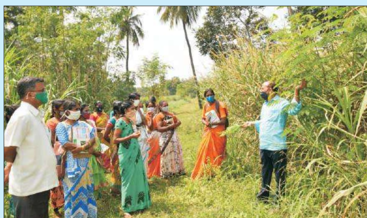
Training Programme to SOS Women Farmers on Cultivation of Fodder Grasses