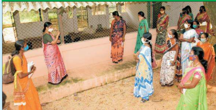
Training Programme to SOS Women Farmers on Rearing of Birds