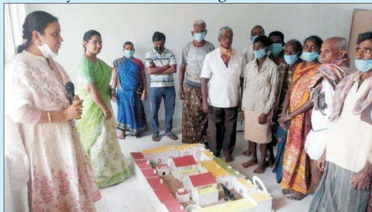
Kisan Mela organized at CVSc, Garividi