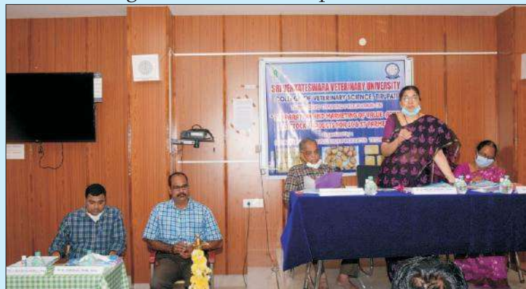
Training on Value added Milk and Meat Products to Women Self Help Groups at Department of LPT, CVSc, Tirupati