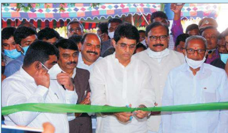
New buildings inaugurated at Sheep and Goat Research Station, Banavasi