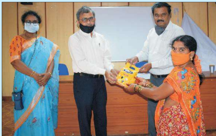
Training Programme on Mineral Supplementation in Dairy Animals