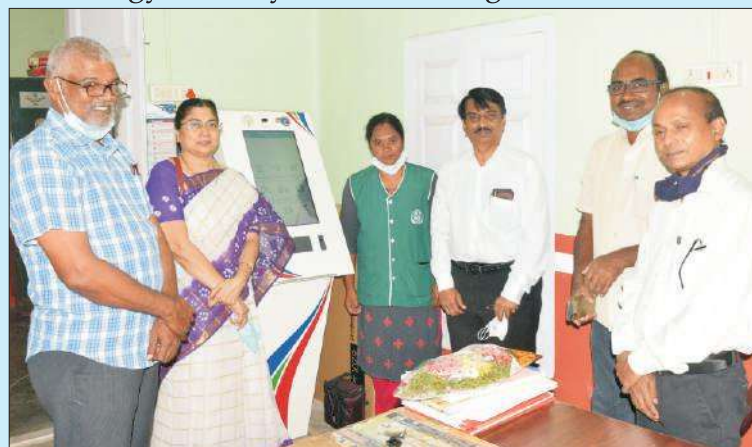
Hon'ble Vice-Chancellor's visit to Tondavada RBK