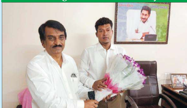
Hon'ble Vice-Chancellor meeting with Hon'ble AH Minister, AP