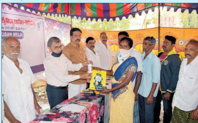
Kisan Mela organized at NTR CVSc, Gannavaram