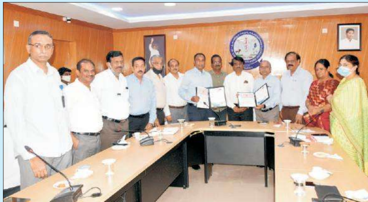
SVVU signed MoU with Indian Immunologicals for development of Foot rot disease vaccine

on 14-12-2020 regarding transfer of technology on tri-valent inactivated whole cell vaccine against ovine foot rot disease for it's first kind in India.